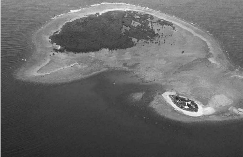
Figure 1.2 Low Isles, a low wooded island near Cairns and site of the 1928–29 Royal Society Expedition.