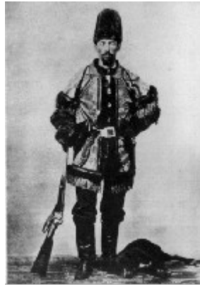
Jayhawker Charles Jennison