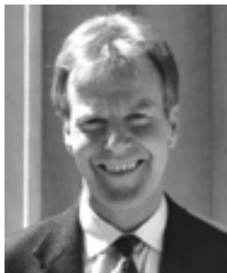
Peter M. Senge