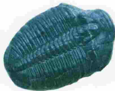
Trilobite Delta, Utah

If every business could grow indefinitely, the total market would grow to an infinite size on a finite earth. It has never happened. Competitors perpetually crowd each other out. The fittest survive and prosper until they displace their competitors or outgrow their resources. What explains this evolutionary process? Why do business competitors achieve the equilibrium they do?