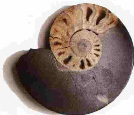
Scaphite South Dakota

Consider this lesson in strategy. In 1934, Professor G.F. Gause of Moscow University, known as “the father of mathematical biology,” published the results of a set of experiments in which he put two very small animals (protozoans) of the same genus in a bottle with an adequate supply of food. If the animals were of different species, they could survive and persist together. If they were of the same species, they could not. This observation led to Gause’s Principle of Competitive Exclusion: No two species can coexist that make their living in the identical way.