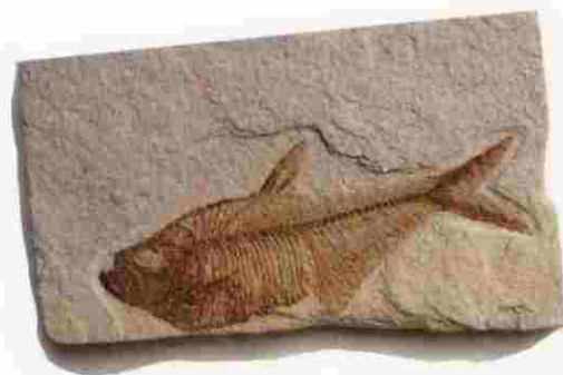
Fossil Fish Green River, Wyoming

Strategic competition compresses time. Competitive shifts that might take generations to evolve instead occur in a few short years. Strategic competition is not new, of course. Its elements have been recognized and used ever since humans combined intelligence, imagination, accumulated resources, and coordinated behavior to wage war. But strategic competition in business is a relatively recent phenomenon. It may well have as profound an impact on business productivity as the industrial revolution had on individual productivity.