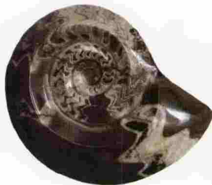
Ammonite Tindouf Basin, Morocco

Chasing market share is almost as productive as chasing the pot of gold at the end of the rainbow. You can never get there. Even if you could, you would find nothing. If you are in business, you already have 100% of your own market. So do your competitors. Your real goal is to expand the size of your market. But you will always have 100% of your market, whether it grows or shrinks.