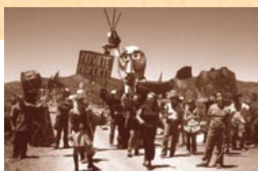
Anti-logging protest of Chicano farmers and environmentalists