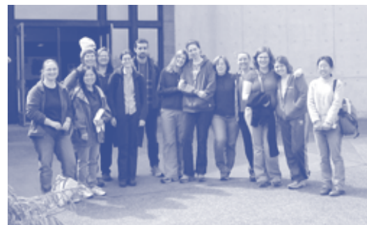
ANTH 458 students, Spring Quarter 2003

Non-Profit Organization US Postage PAID Seattle, Washington Permit No 62