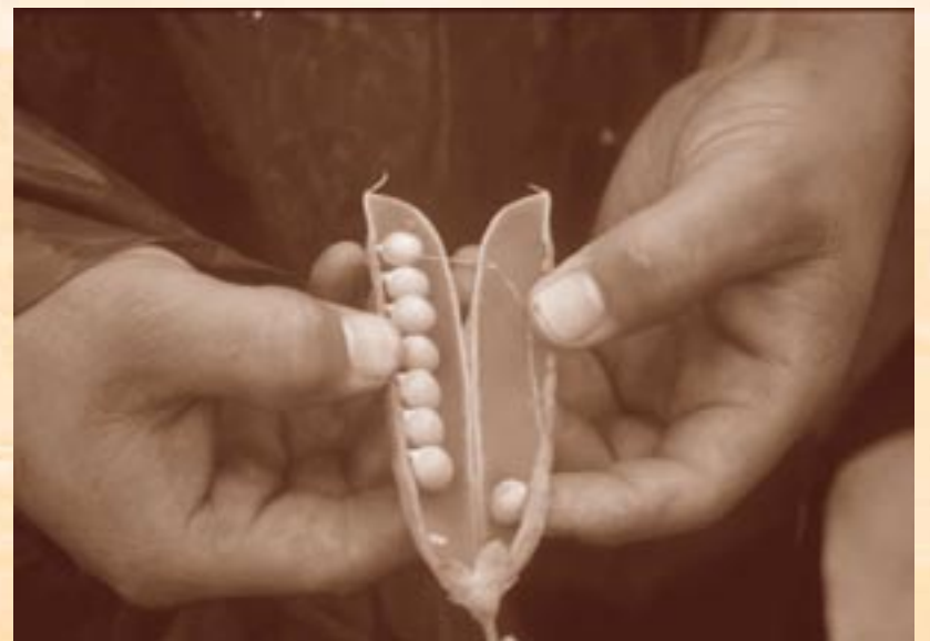
Organic heirloom peas from acequia farm in Colorado