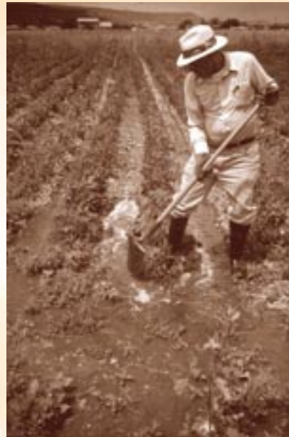
Acequia farmer irrigates field of heirloom crops