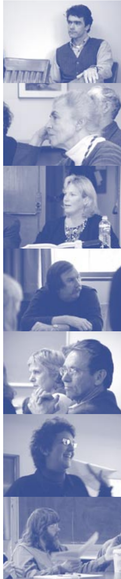
Faculty Photos Top to Bottom