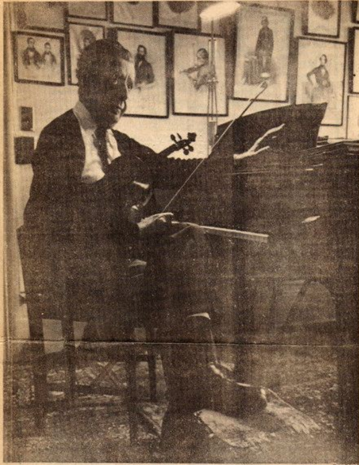
The late Ivan Galamian—"He could take a table and teach it to play the violin."