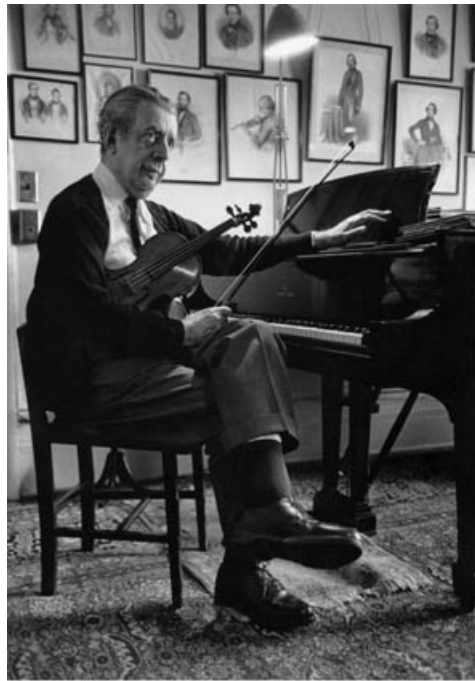
586-22 Ivan Galamian, 1977