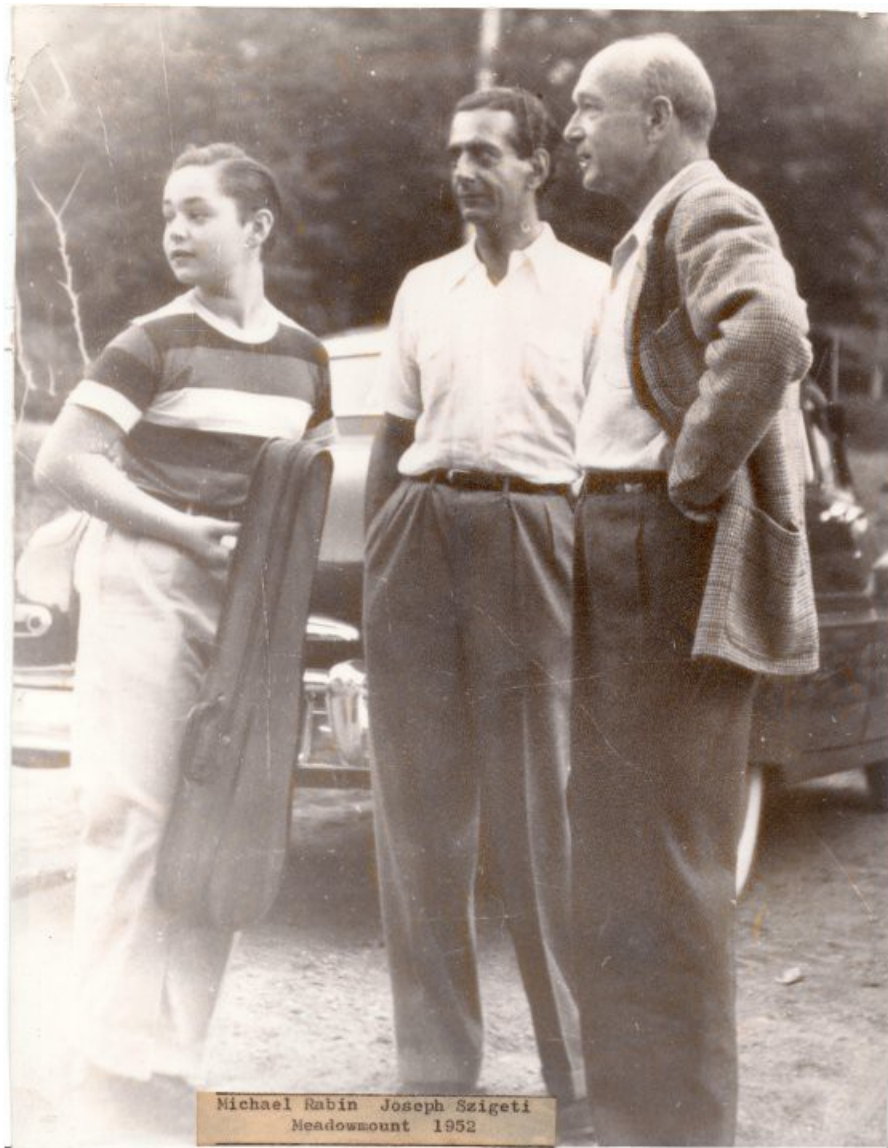
Michael Rabin, Ivan Galamian and Joseph Szigeti