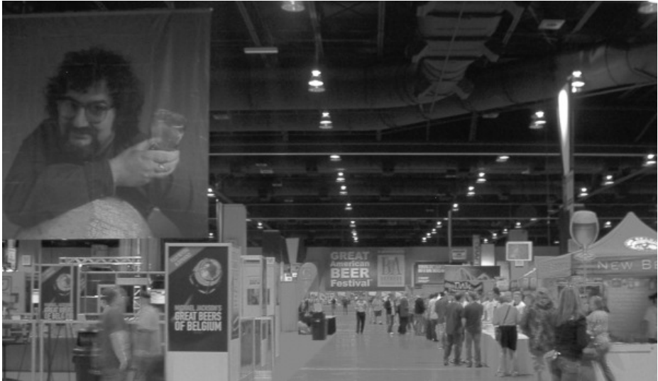
Figure 5. Great American Beer Festival: Michael Jackson banner hangs overhead in the Great Hall of the Colorado Convention Center.

future generations to fully appreciate craft beer and expand upon the vision he championed.