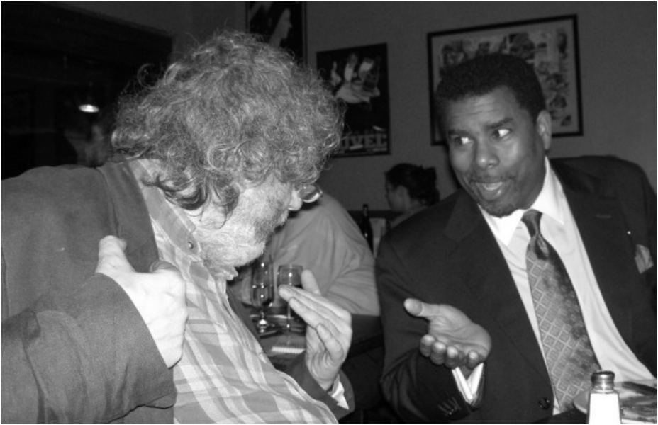
Figure 3. Michael Jackson with Brewmaster Garrett Oliver of Brooklyn Brewing.

Jackson's accolades of exceptional beers (and whiskies) filled the pages of 18 major titles in 21 languages, as well as in special commissioned editions. His final 'edited' book, Eyewitness Companions Beer , published by Dorling Kindersley, was released one year after his death in 2008.