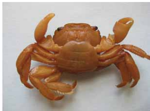
FIG. 5. Planes minutus , female, CL: 18.9 mm, dorsal and ventral view.