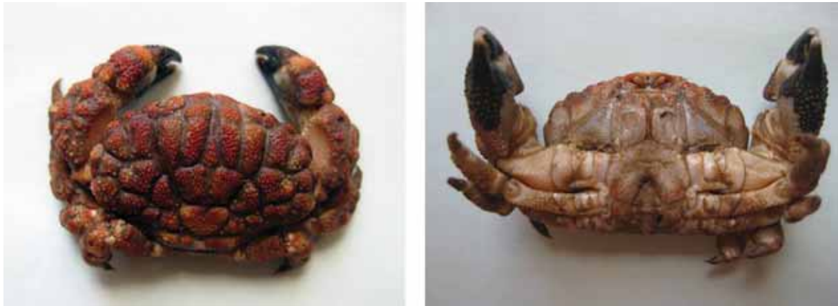
FIG. 3. Paractaea monodi , male, CL: 20.5 mm, dorsal and ventral view.