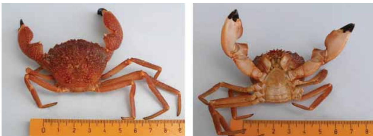
FIG. 4. A live female of Paragalene longicrura , CL: 32.9, dorsal and ventral view.

According to Udekem d'Acoz (1999), P. longicrura occurs in dark caves and on hard bottoms with algal growth and shells, at depths between 30 and 160 m, as confirmed by the species finding in Rhodes.