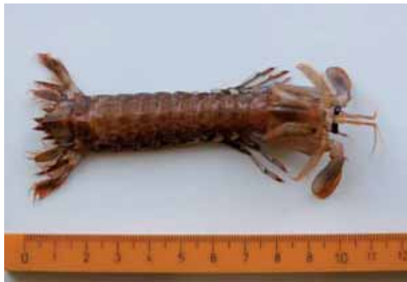
FIG. 2. Male specimen of Parasquilla ferussaci , TL 92.7 mm.

Parasquilla ferussaci (Fig. 2) is considered a rare species (Özcan et al. , 2008a). Its usual habitat appears to be the muddy and lightly sandy substrates (Abelló et al. , 1993), at depths between 175 and 700 m, but also on the continental shelf (Colmenero et al. , 2009). The known distribution of P. ferussaci comprises the Eastern Central Atlantic and the Mediterranean Sea, mainly its western part (Colmenero et al. , 2009 and references therein). The occurrence of the species in the Eastern Mediterranean was firstly reported from Rethymnon Bay, northern coast of Crete, at 50 m of depth on soft bottom (Dounas & Steudel, 1994) and more recently in the Turkish waters of the NE Aegean Sea, near Babakale, at depth between 150 and 200 m, on sandy-silt bottom (Özcan et al. , 2008a).