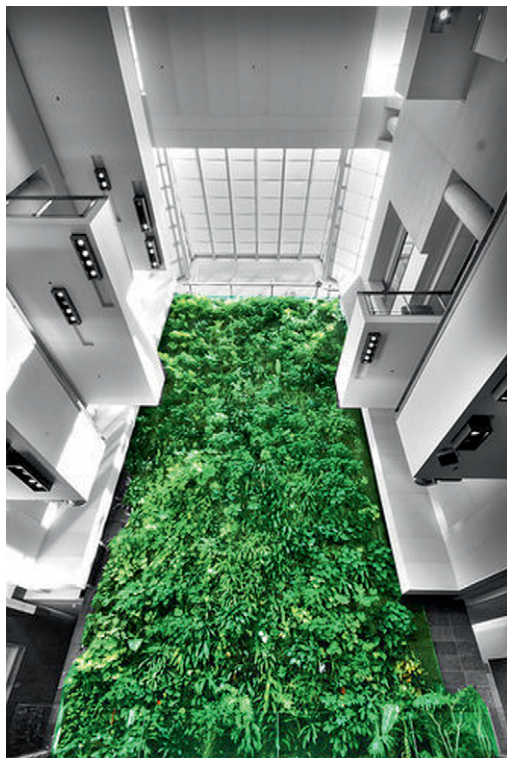
Figure 2 Example of a typical botanical indoor air biofilter installation, located in the atrium of the University of Guelph-Humber building, Humber College, http://www.guelphhumber.ca/ , photo courtesy of Nedlaw Living Walls Ltd.

steady-state elimination capacities have ranged from 0.15 to 4 g m -3 h -1 for ketones and 0.08 to 1.6 g m -3 h -1 for BTEX [39, 40, 42, 44, 45, 48, 49].