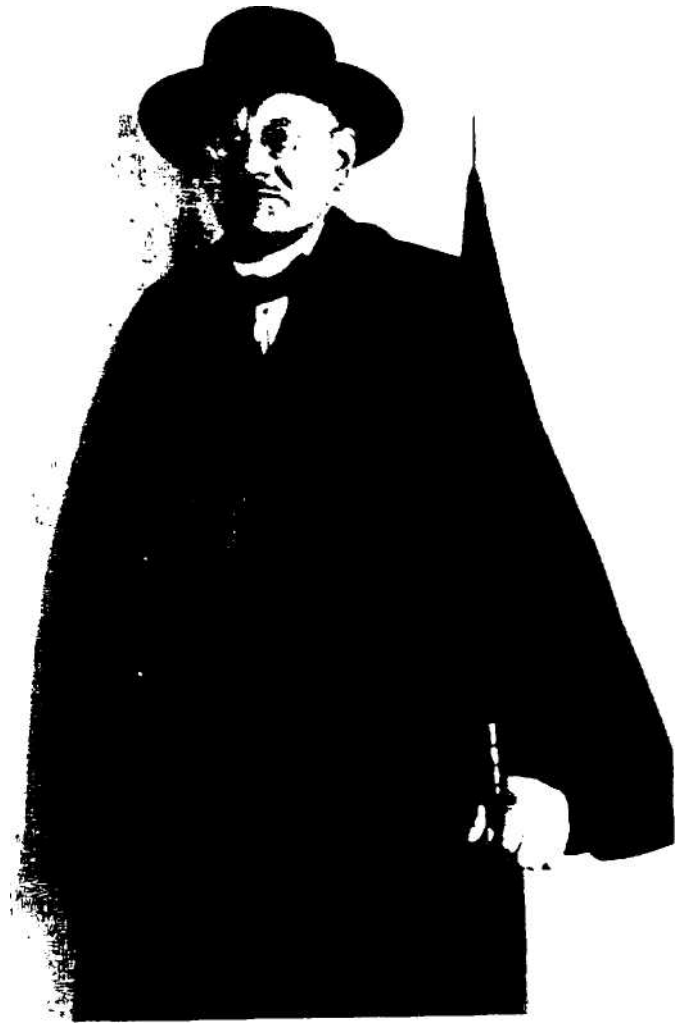
Parliamentary Representative (a Democrat) . Photo by August Sander.

with quantities of game that is useless to anyone but the merchant. And the day does indeed seem to be at hand when there will be more illustrated magazines than game merchants. So much for the snapshot. But the emphasis changes completely if we turn from photography-as-art to art-as-photography. Everyone will have noticed how much easier it is to get hold of a painting, more particularly a sculpture, and especially architecture, in a photograph than in reality. It is all too tempting to blame this squarely on the decline of artistic appreciation, on a failure of contemporary' sensibility. But one is brought up short by the way the understanding of great works was transformed at about the same time the techniques of reproduction were being developed. Such works can no longer be regarded as the products of individuals; they have become a collective creation, a corpus so vast it can be assimilated only through miniaturization. In the final analysis, mechanical reproduction is a technique of diminution that helps people to achieve control over works of art—a control without whose aid they could no longer be used.