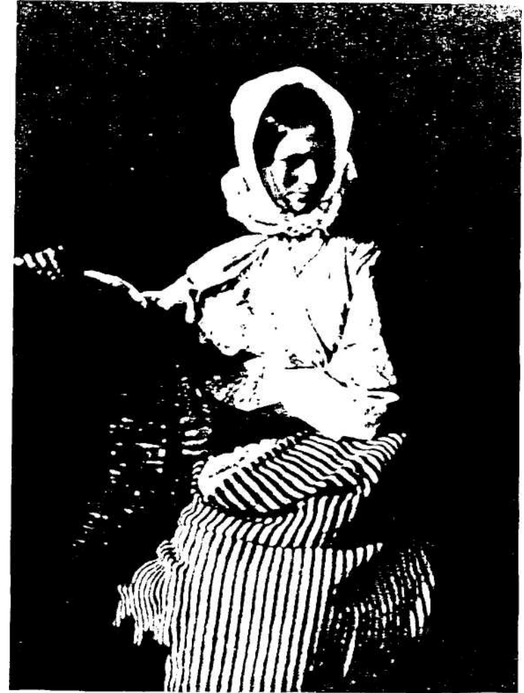
Newhaven Fishwife.

Daguerre's photographs were iodized silver plates exposed in the camera obscura, which had to be turned this way and that until, in the proper light, a pale gray image could be discerned. They were one of a kind; in 1839 a plate cost an average of 25 gold francs. They were not infrequently kept in a case, like jewelry. In the hands of many a painter, though, they became a technical adjunct. Just as seventy years later Utrillo painted his fascinating views of Paris not from life but from picture postcards, 5 so the highly regarded English portrait painter David Octavius Hill based his fresco of