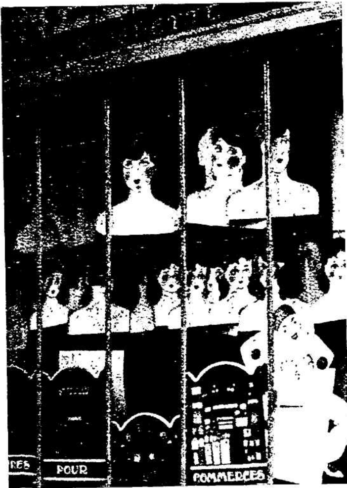
Display Window