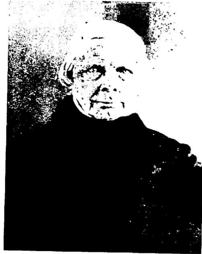
The Philosopher Schelling, ca. 1850.

The first people to be reproduced entered the visual space of photography with their innocence intact—or rather, without inscription. Newspapers were still a luxury item which people seldom bought, preferring to consult them in the coffeehouse; photography had not yet become a journalistic tool, and ordinary people had yet to see their names in print. The human countenance had a silence about it in which the gaze rested. In short, the portraiture of this period owes its effect to the absence of contact between contemporary relevance and photography. Many of Hill's portraits were made in the Edinburgh Greyfriars cemetery—and nothing is more characteristic of this early period, except perhaps the way his subjects were at home there. And indeed the cemetery itself, in one of Hill's pictures, looks like an interior, a separate closed-off space where the gravestones propped against gable walls rise up from the grass, hollowed out like chimneypieces,