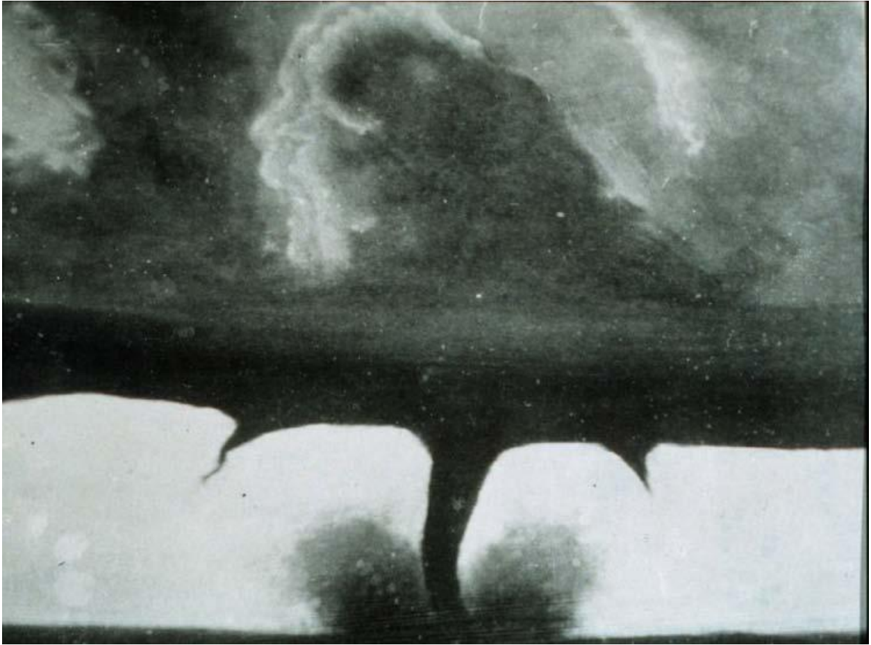
Oldest Known Tornado Photo - Date: 1884 August 28

NOAA Miami Regional Library Disaster Information Series All material held in the NOAA Libraries